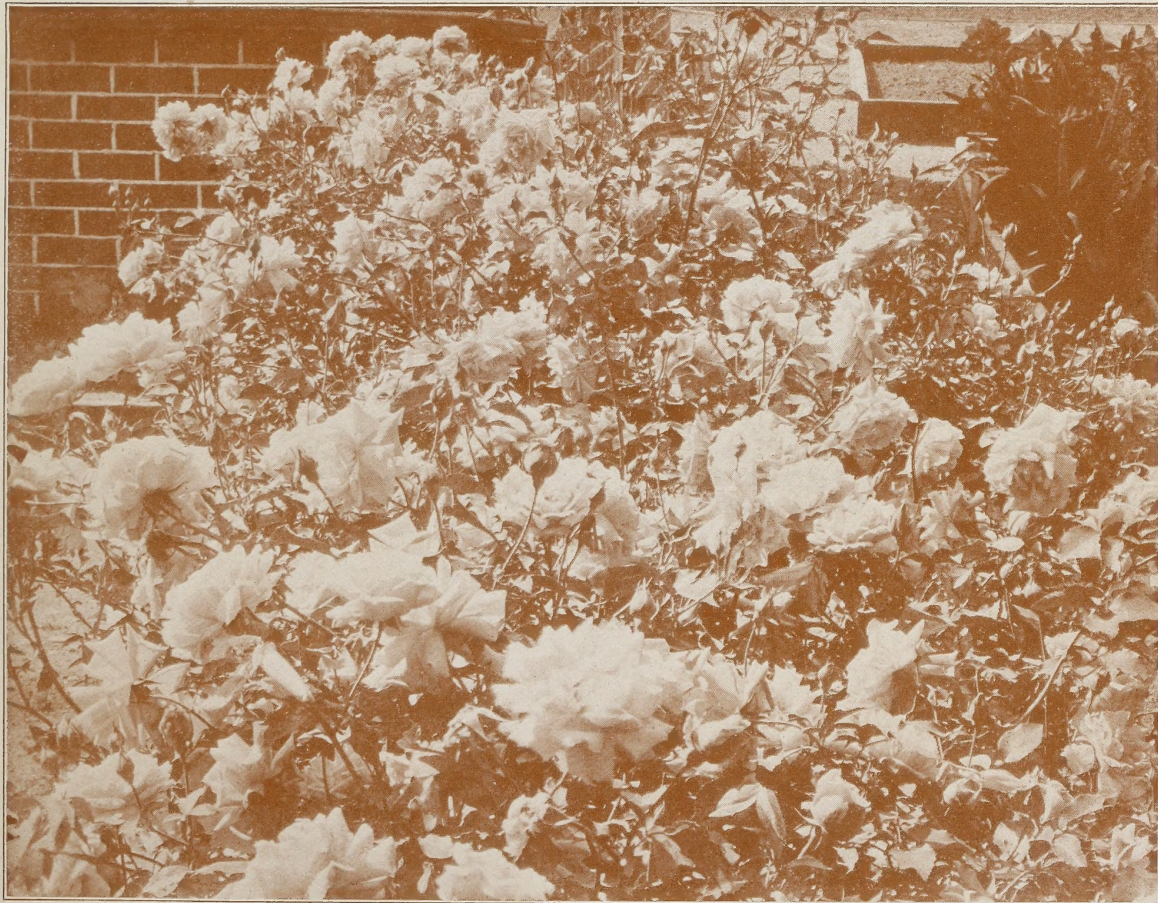
The Everblooming "Santa Rosa" Rose.